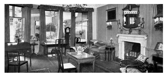
Sitting Room, 1920's